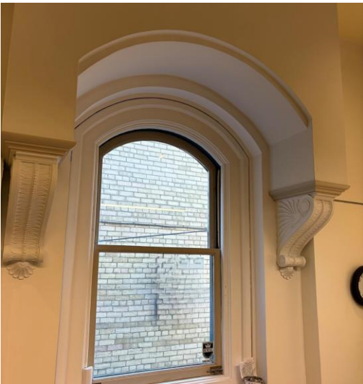
Main Floor & Lower Floor, 185 Carlton Street, Toronto