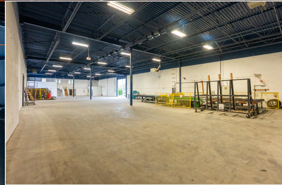
Property 1 // 1580 Kingsway Ave