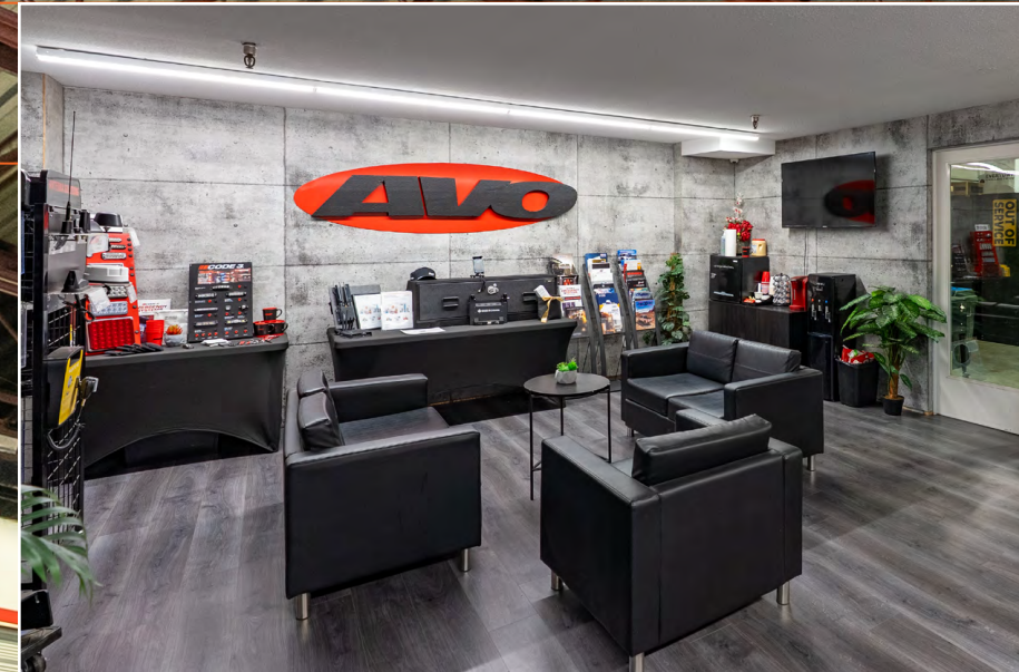
Property 2 // 1600 Kingsway Ave