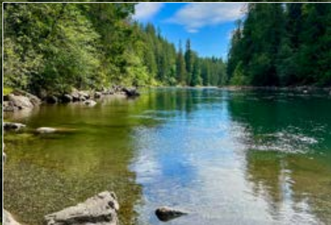
Stamp River (south)

// The region is characterized by its mix of agricultural lands, forests, and residential properties, offering a tranquil lifestyle amidst a picturesque landscape.