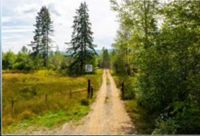
Main entrance to property