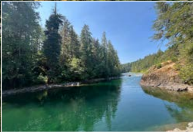
Stamp River (north)