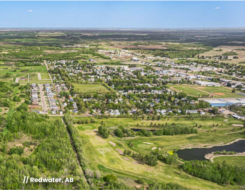
// Redwater, AB